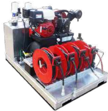
LUBE BUDDY JR.