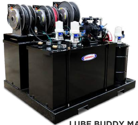
LUBE BUDDY MAX

Two options provide a mobile service center designed for your light-duty pickup truck or medium-duty flatbed. The Lube Buddy, Jr, or Lube Buddy Max are easily transferable from the truck to the job site, making the Lube Buddy work where you need it. The Lube Buddy is a must-have for any operation to service equipment when and where you need to.