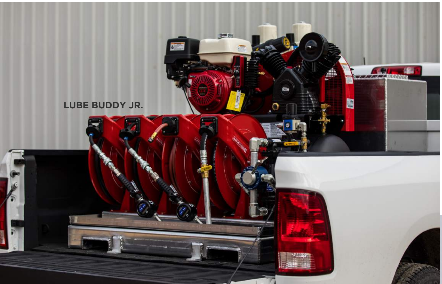
LUBE BUDDY JR.