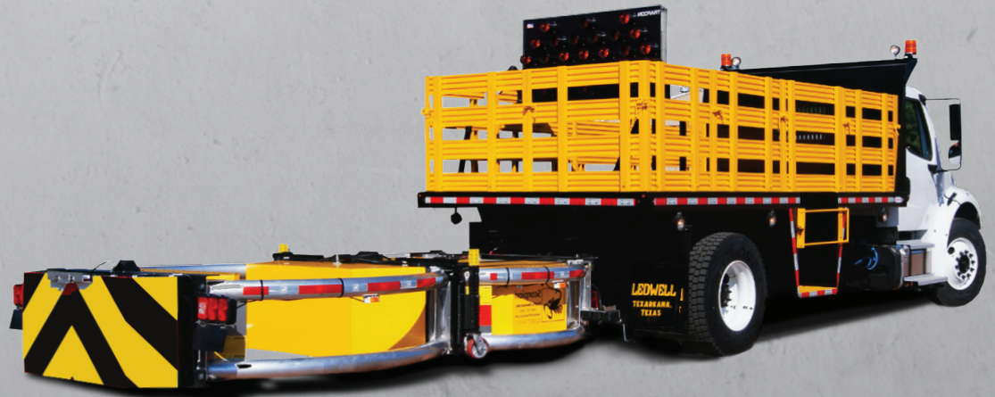
TL-3 MODEL C