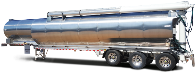
DRAG CHAIN TRAILER