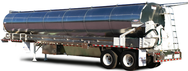
HIGH VOLUME PADDLE WAGON TRAILER

VISIT OUR WEBSITE AT LEDWELL.COM TO VIEW OUR FULL LINE OF EQUIPMENT